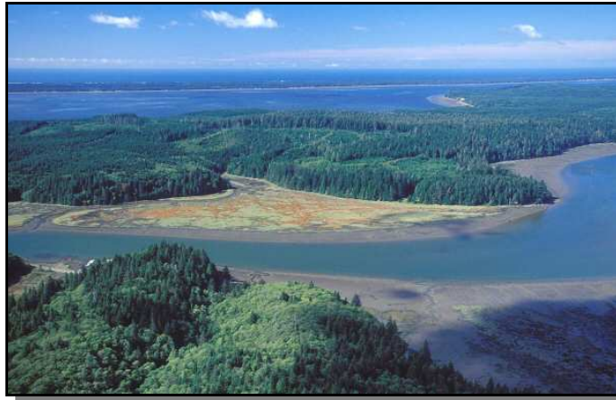
Looking West ~ Aerial Photo of Long Island