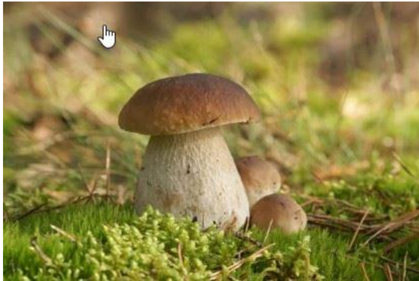
King bolete mushroom ( Boletus edulis )