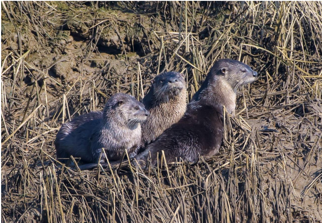
Otters at Tarlatt Unit WNWR

Inside: Winter Wonders of Willapa, Holiday Giving to the Friends, Mushrooms at the Refuge, Nature Notes Coordinator needed, Fun Winter Crafts for Birds Holiday Wild Gift Ideas, President's Corner