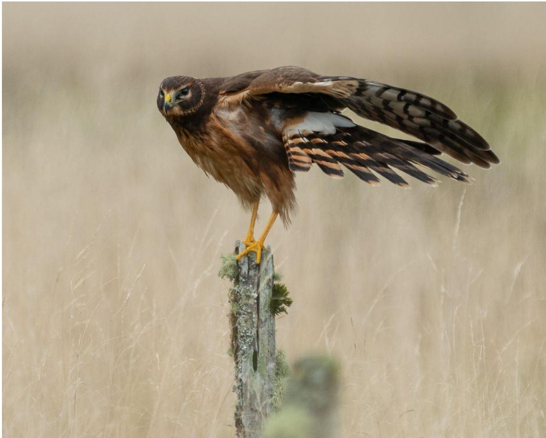
Northern Harrier near Willapa Bay