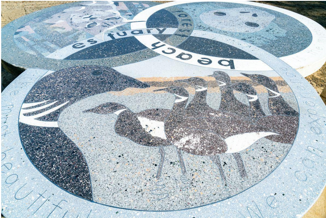
One of the newly-installed art tables